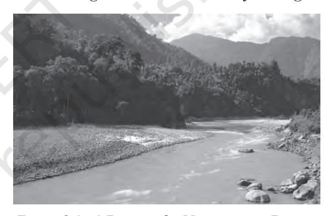
Figure 3.1: A River in the Mountainous Region

2006) in this class. Can you, then, explain the reason for water flowing from one direction to the other? Why do the rivers originating from the Himalayas in the northern India and the Western Ghat in the southern India flow towards the east and discharge their waters in the Bay of Bengal?