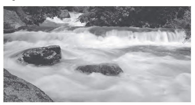
Figure 3.3: Rapids

The Himalayan drainage system has evolved through a long geological history. It mainly includes the Ganga, the Indus and the Brahmaputra river basins. Since these are fed both by melting of snow and precipitation, rivers of this system are perennial. These rivers pass through the giant gorges carved out by the erosional activity carried on simultaneously with the uplift of the Himalayas. Besides deep gorges, these rivers also form V-shaped valleys, rapids and waterfalls in their mountainous